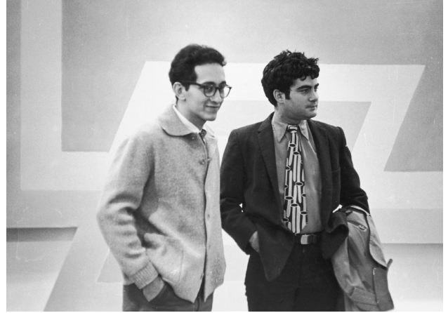
Frank Stella (left) and Larry Poons attend an exhibition of Stella's work at the Castelli Gallery, New York, March 5, 1966.

YARES ART is pleased to present Larry Poons / Frank Stella: As It Was, As It Is , on view in New York, March 20–July 31, 2021. This show brings together important historical and recent works by two legendary figures in contemporary American art. Frank Stella (b.1936) and Larry Poons (b.1937) came to the forefront of the avant-garde art scene in the same place, and at approximately the same time—New York City in the late 1950s and early 1960s. Like-minded spirits, and longtime friends, the two went on to electrify the art world in the second half of the twentieth century with unique visions and profoundly original works. Both artists to this day continue to share a passion for speed and racing—Poons, a racer of vintage motorcycles, and Stella lauded in the sport of auto-racing for his car designs for BMW and other companies.